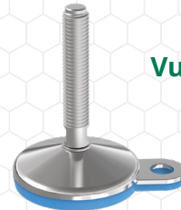
Vulcanized Rubber Leveling Feet